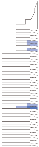
1530 - 3,138 RSF

Flexible occupancy; Will build to new standard; Test fit shown; Adaptable to tenant's requirement